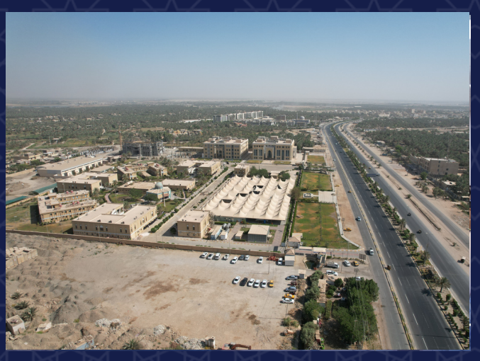
Preparing pitch for sports field

Sport facilities for extracurricula activities to help students maintain a healthy lifestyle and induce sportsmanship in their young minds. These facilities are also opened for our staff with regular arrangement